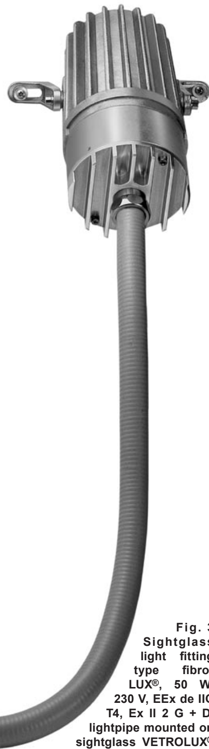
Fig. 3 Sightglass light fitting type fibre- LUX®, 50 W, 230 V, EEx de IIC T4, Ex II 2 G + D, lightpipe mounted on sightglass VETROLUX® to DIN 28120, DN 25

An important pre-selection is given by the temperature class, to be determined by the user of the plant. Most production sites are classified T3 or T4, rarely T6. Since the maximum allowed surface