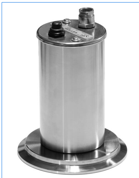
Sightglass light fitting type KLR 20 HDA Sp, 20 W, 115 V, with built-in momentary push-button "D", on metal fused sightglass for Triclamp fittings, DN 100