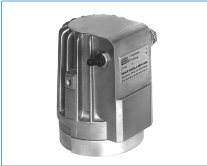
Type KL 20 HE sp, 20 W, 240 V, equipped with ON-OFF-switch "E"

As a means both of saving energy and reducing the overhead costs involved in bulb changes, MAX MÜLLER AG have for 30 years been considering possible ways of reducing the period of time that sightglass light fittings are unnecessarily switched on. Using one of the following systems to limit this period, the bulb life may be effectively increased and the concomitant costs of downtime thereby decreased. (Please refer to the table overleaf for standard options.)