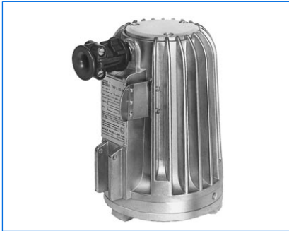
Type L 20 dHVsp, 20 W, 115 V, Ex d IIC T5, Ex tD A21 IP65 T95°C, Ex II 2 G + D, equipped with timer "V"