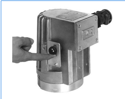
Type PEL 50 deHV, 50 W, 230 V, Ex de IIC T4, Ex tD A21 IP65 T130°C, Ex II 2 G + D, equipped with timer "V"