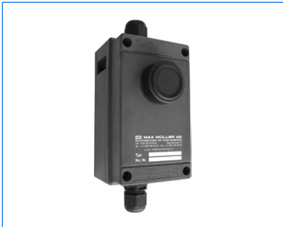
Timer for remote operation "U3", Ex de IIC T6, Ex tD A21 IP65 T80°, Ex II 2 G + D