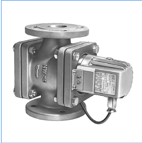
Sight flow indicator, type FDE 50, with sightglass light fitting type FKEL 5 dH WM, Ex d IIC T6, Ex tD A21 IP65 T80°C, Ex II 2 G + D, 230 V, 5 W, with opal glass screen «M»