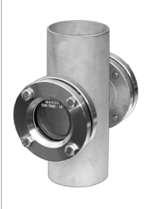
Sight flow indicator, series S-VA, type S-VA 80