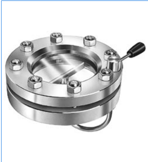
Wiper system WS, built into a VETROLUX® sightglass to DIN 28120, DN 100, PN 10.