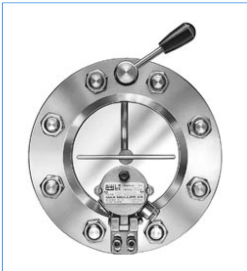
Wiper system WS, built into a VETROLUX® sightglass to DIN 28120, DN 100, PN 10, with mounted sightglass light fitting miniLUX®, type KVL 50 HDSch, 24 V, 50 W, for combined “view and light through one assembly”.

As a complete set with detailed mounting instructions to be built into existing sightglasses or supplied together with a complete sightglass VETROLUX® to your specifications. In the second case, MAX MÜLLER AG carries out the necessary machining of the welding and the cover flange of the sightglass.