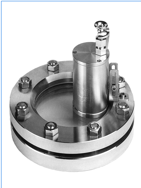
Sightglass light fitting type EdelEx d LED Sch K1, ca. 5 W, 100 - 240 V, Ex d IIC T6, Ex tD A21 IP65 T80°C, Ex II 2 G + D, mounted onto circular sightglass to DIN 28120, PN 10, DN 125.