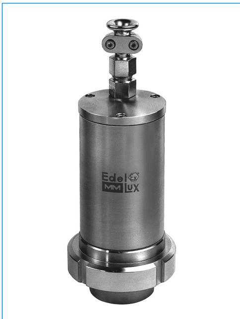
Sightglass light fitting type EdelEx d LED R50 K1, ca. 2 W, 24 V, Ex d IIC T6, Ex tD A21 IP65 T80°C, Ex II 2 G + D, with intermediate flange collar fixation "R", mounted onto a screwed sightglass similar to DIN 11851, PN 6, DN 50.

Equipped with state-of-the-art LED technology, with an uncompromising design and the reputed MAX MÜLLER quality, the series EdelEx LED offers to the fabricators and users of all stainless steel process equipment the following important advantages: