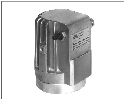
Type KL 20 HE sp, 20 W, 240 V, equipped with ON-OFF-switch "E"

As a means both of saving energy and reducing the overhead costs involved in bulb changes, MAX MÜLLER AG have for 30 years been considering possible ways of reducing the period of time that sightglass light fittings are unnecessarily switched on. Using one of the following systems to limit this period, the bulb life may be effectively increased and the concomitant costs of downtime thereby decreased. (Please refer to the table overleaf for standard options.)