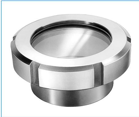
Screwed sightglass, DN 100, PN 6, type SSA 100