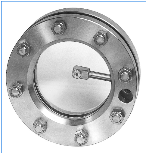
Spraying unit, type SV 4, built into circular sightglass similar to DIN 28120, DN 125, PN 6.