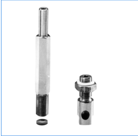
Spraying unit of the series SVS