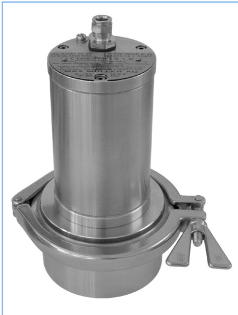
Sightglass light fitting, type EdelEx STERI-LINE 20 dH, 24 V, 20 W, Ex d IIC T4, Ex tD A21 IP65 T130°C, Ex II 2 G + D, on metal fused sightglass, DN 100