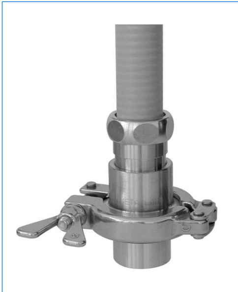
Metal fused sightglass, 1", with lightpipe end of the fibroLUX fibre optic sightglass light fitting